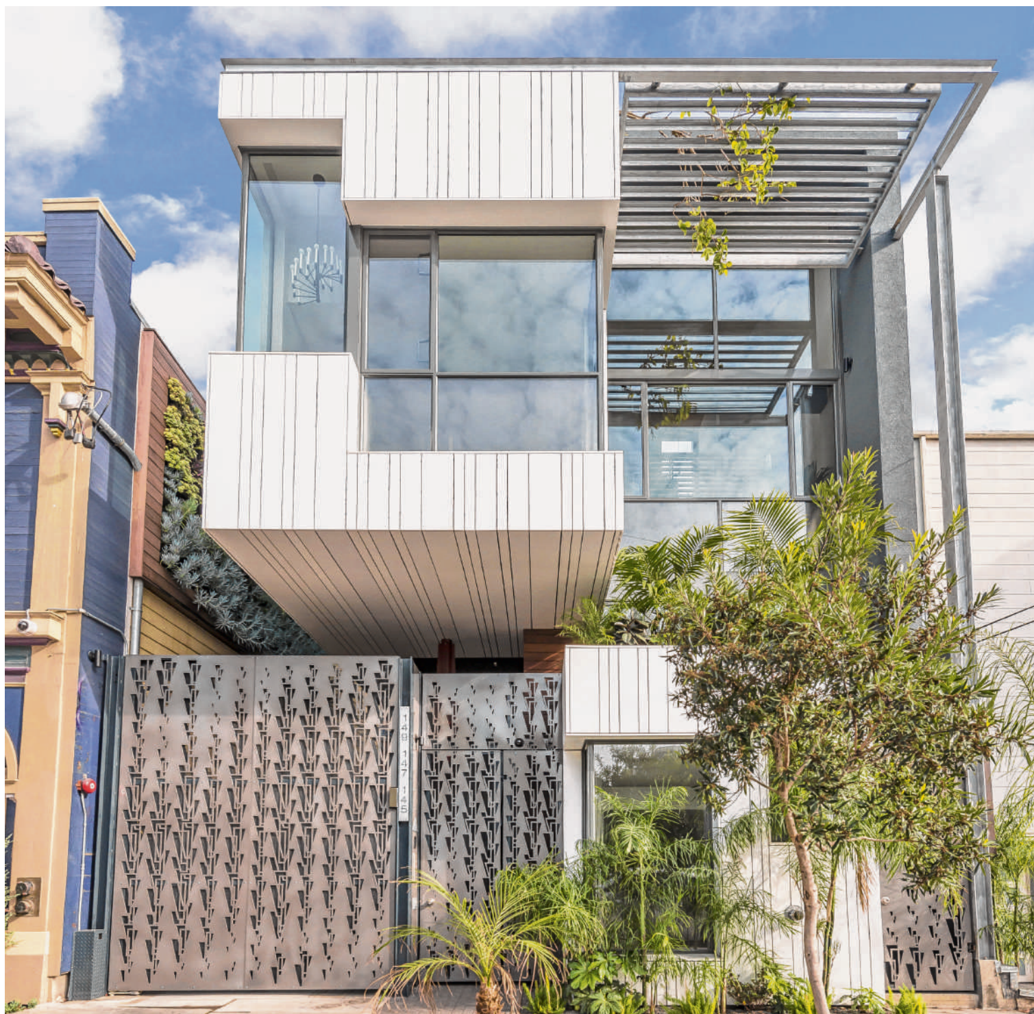
The facade features clean lines and large windows.

In addition to the entry, walnut woodworking is found throughout the penthouse, like in the millwork in a concealed office. The primary suite hosts a spa bathroom highlighted by a marble walk-in steam shower